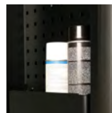
Can holder included