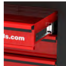
Stable ball bearing