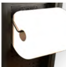
Paper roll holder included