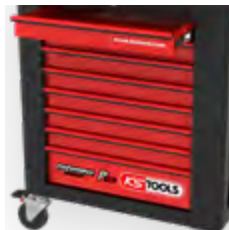
Eight drawers each load capacity up to 50 kg