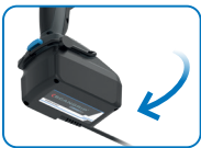
Use SCANGRIP POWER SUPPLY for direct power

BATTERY, CHARGER, CONNECTORS AND POWER SUPPLY ARE SOLD SEPARATELY