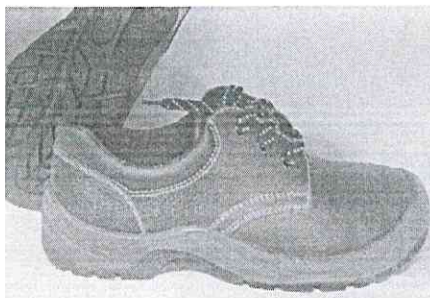
10-200 Elba S3

The above product is in conformity with the regulation (EU) 2016/425 and is identical to the PPE which is subject of EU certificate.....374444..... issued by: