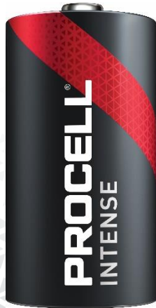
Size: D (LR20) PX1300